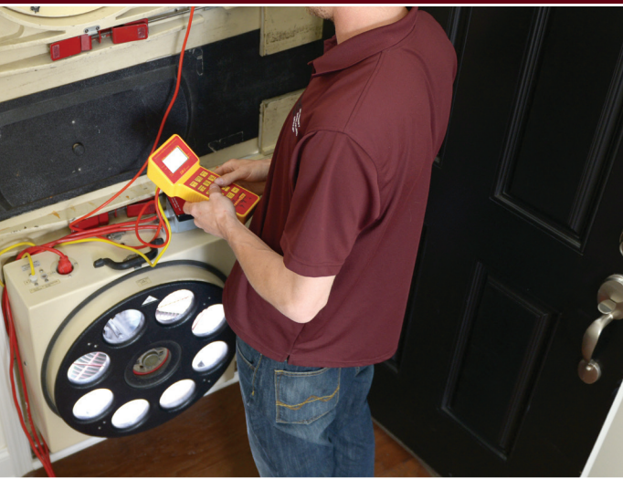
A Blower Door Test is performed on every Schell Brothers Home to obtain your home's HERS score.