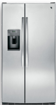
GE® SIDE-BY-SIDE REFRIGERATOR

Please note: photos include optional selections