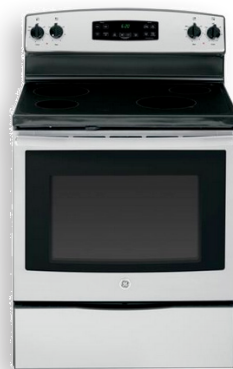
GE® ELECTRIC RANGE