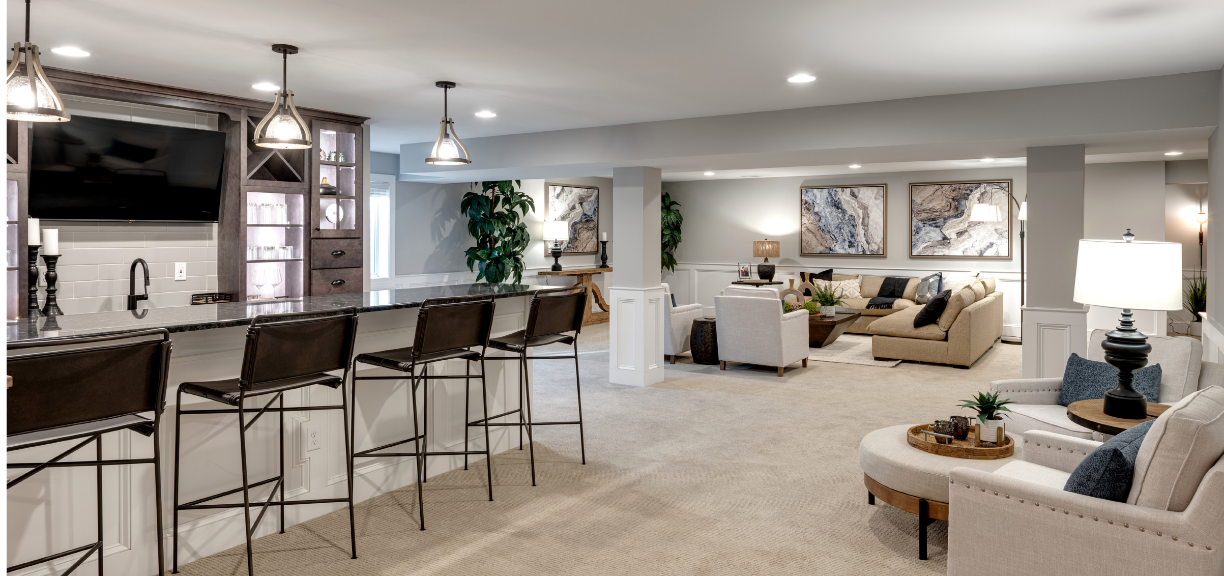
Please note: photos include optional selections

Energy-efficient LED lighting throughout the home helps you save on utilities while providing long-lasting, warm illumination.