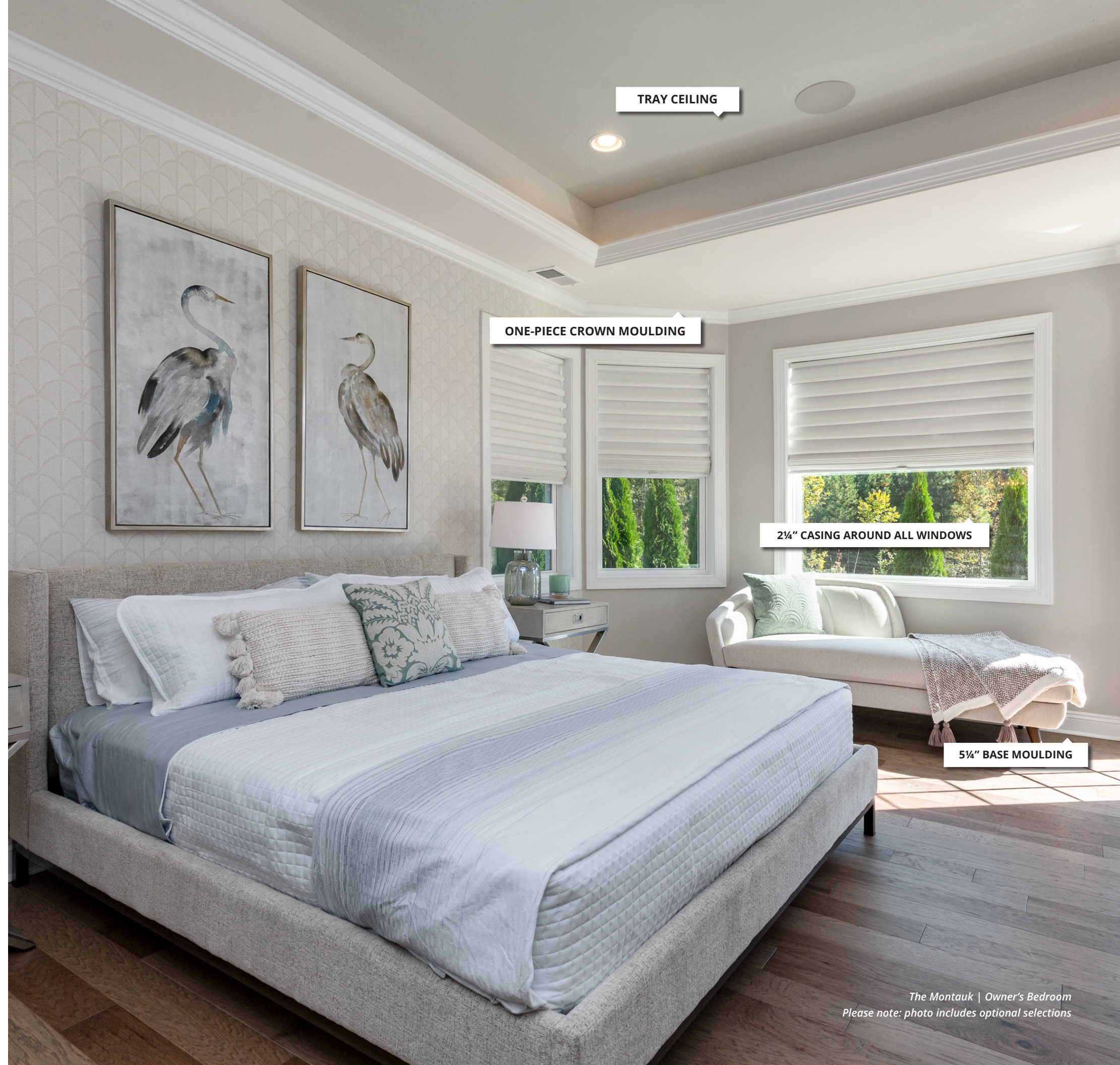
The Montauk | Owner's Bedroom Please note: photo includes optional selections

Per the City of Milford, sprinklers are required and therefore included in your Schell Brothers home at Red Cedar Farms.