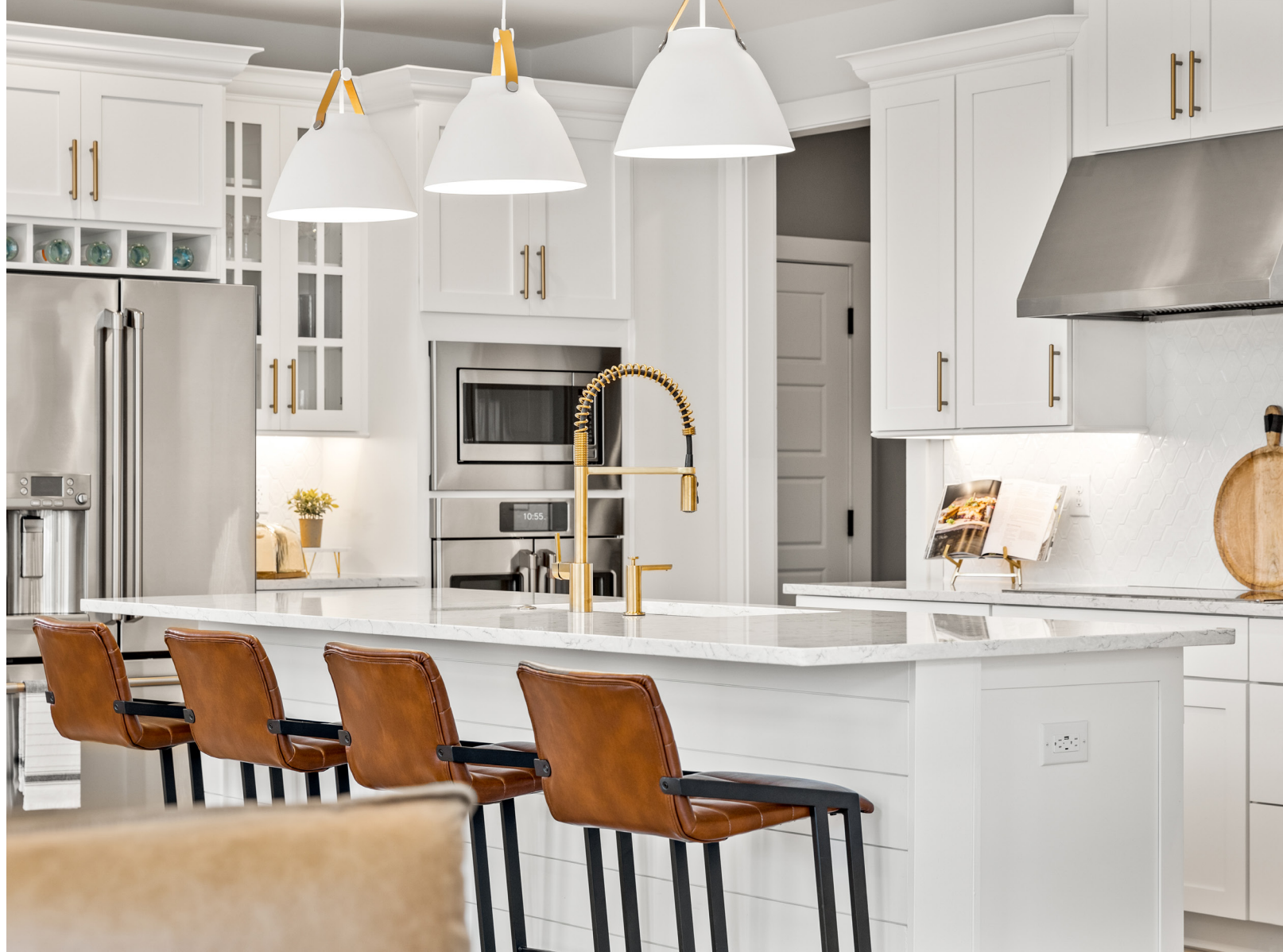
Please note: photos include optional selections