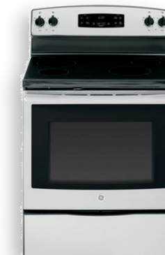
GE® ELECTRIC RANGE