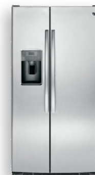
GE® SIDE-BY-SIDE REFRIGERATOR

Please note: photos include optional selections