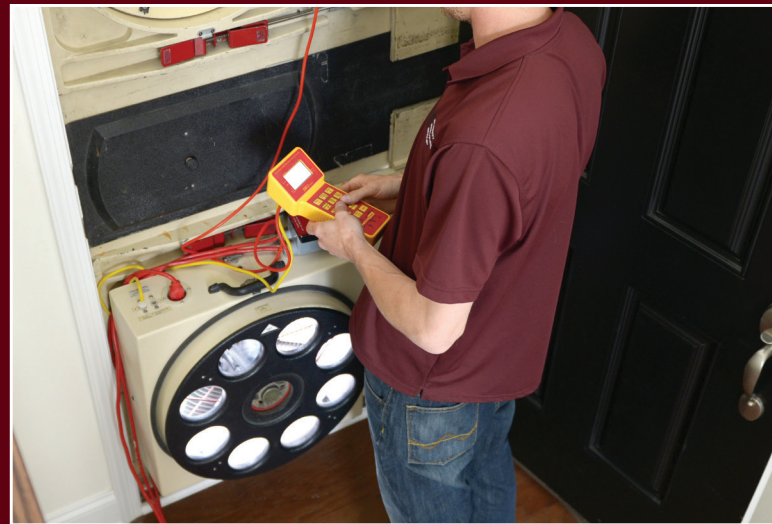
A Blower Door Test is performed on every Schell Brothers Home to obtain your home's HERS score.

HERS SCALE The Home Energy Rating System (HERS) measures a home's energy efficiency.