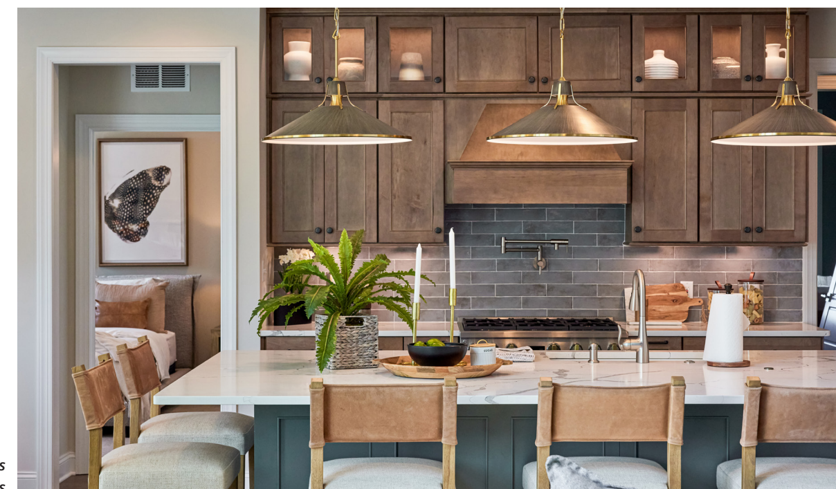
Please note: photos include optional selections

Because no one should have to hunt for a charger, we include USB-C and USB-A combo outlets in key kitchen locations. Your devices stay charged, and your counters stay clutter-free.