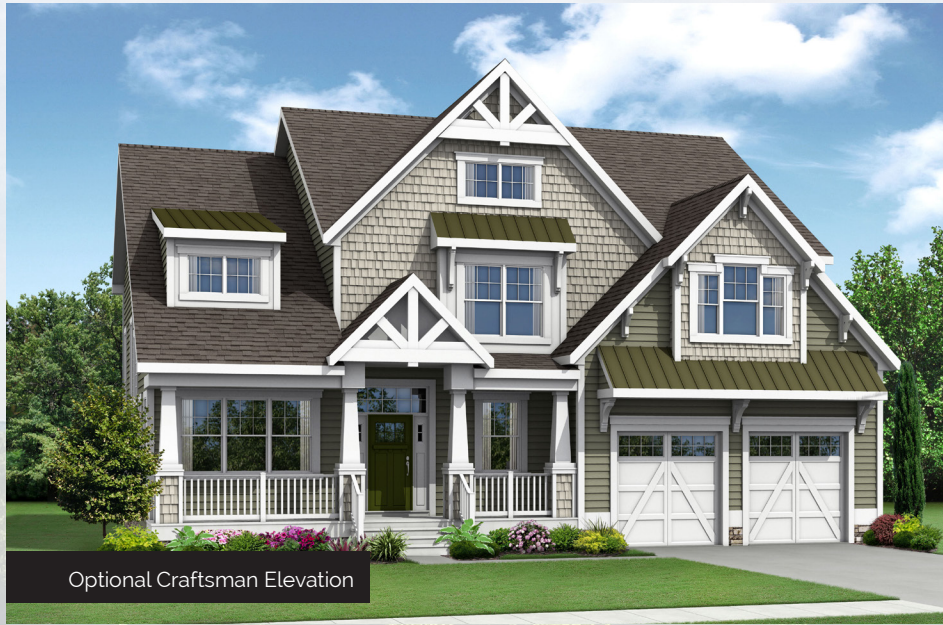
Optional Craftsman Elevation