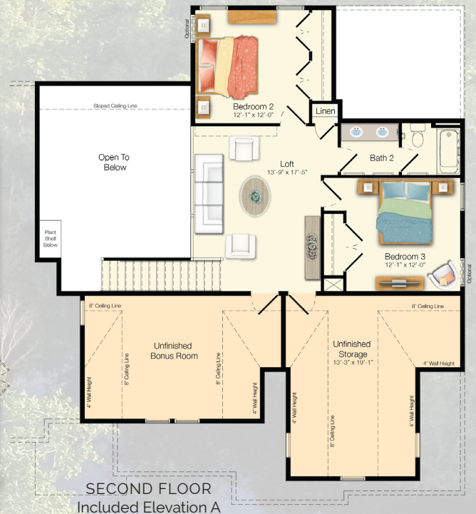
SECOND FLOOR Included Elevation A