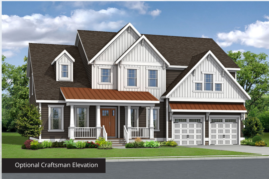
Optional Craftsman Elevation