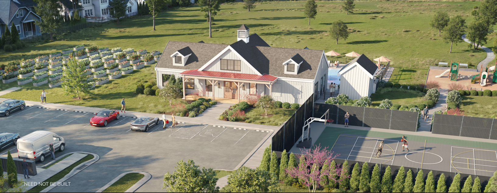
*NEED NOT BE BUILT