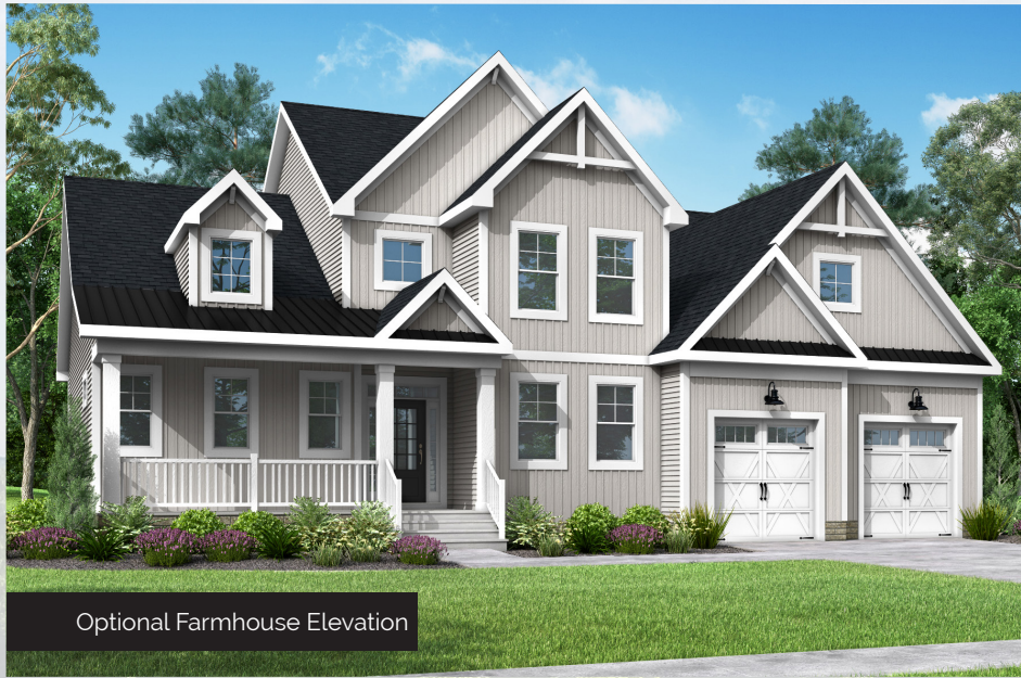
Optional Farmhouse Elevation