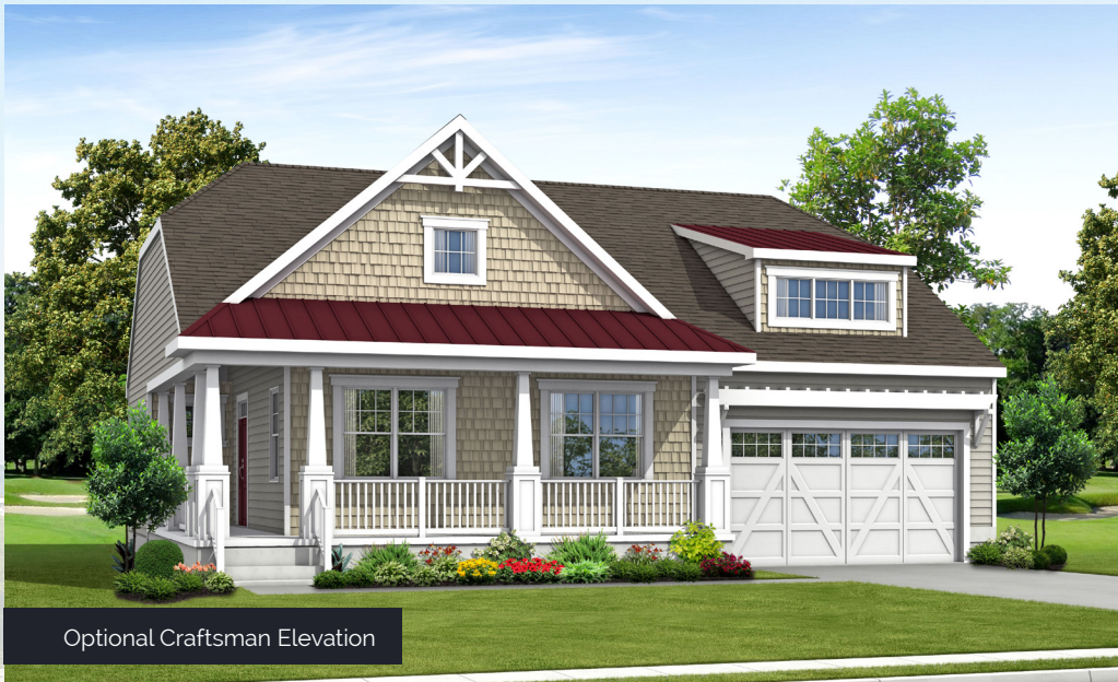
Optional Craftsman Elevation