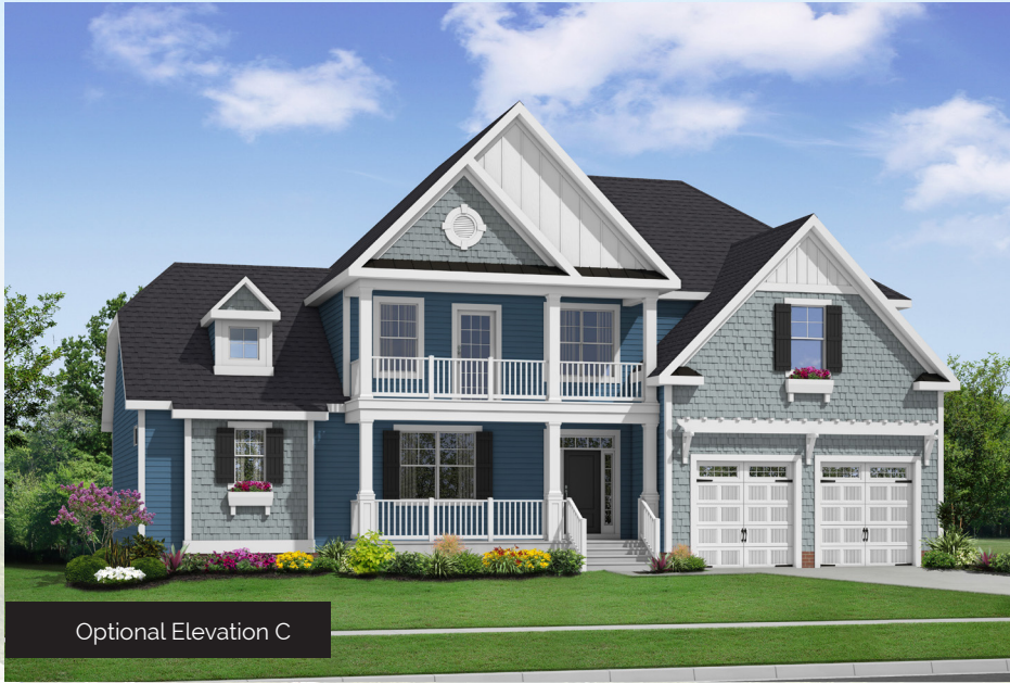
Optional Elevation C