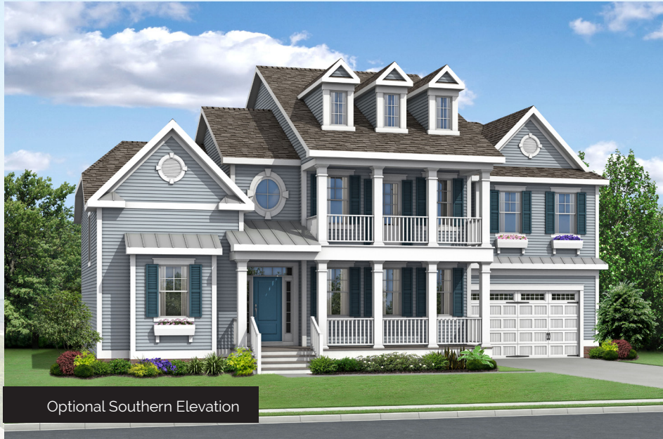
Optional Southern Elevation