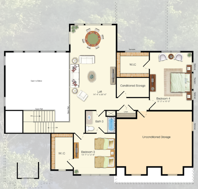
SECOND FLOOR Included Elevation A