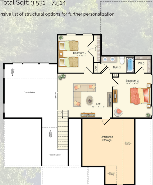
SECOND FLOOR Included Elevation A