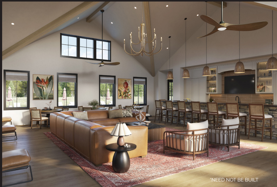
*NEED NOT BE BUILT