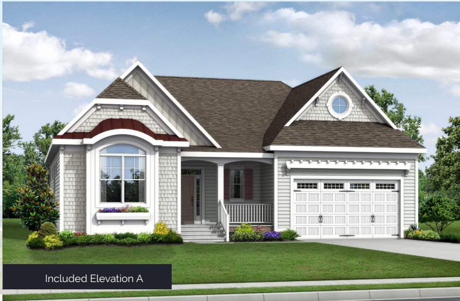
Included Elevation A