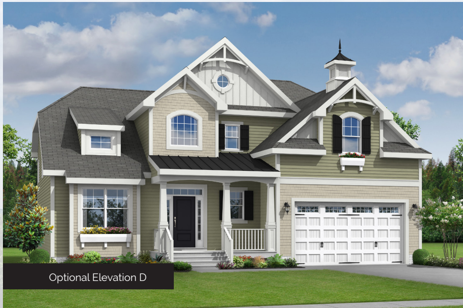
Optional Elevation D