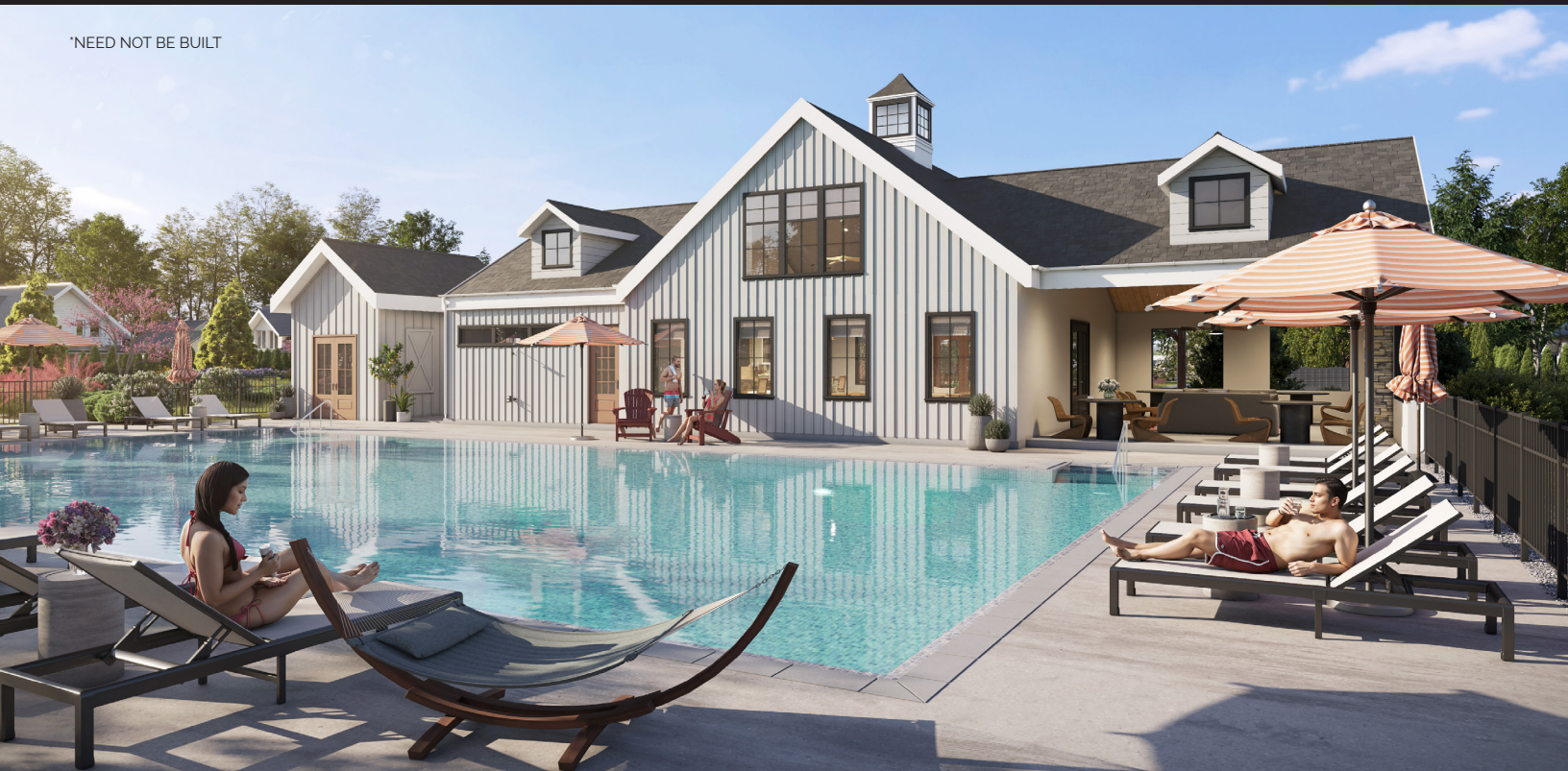
*NEED NOT BE BUILT