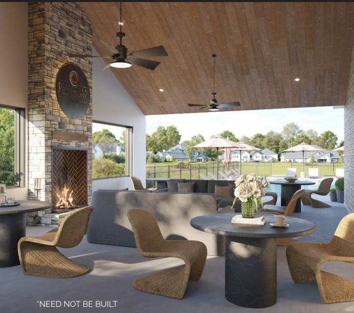
*NEED NOT BE BUILT