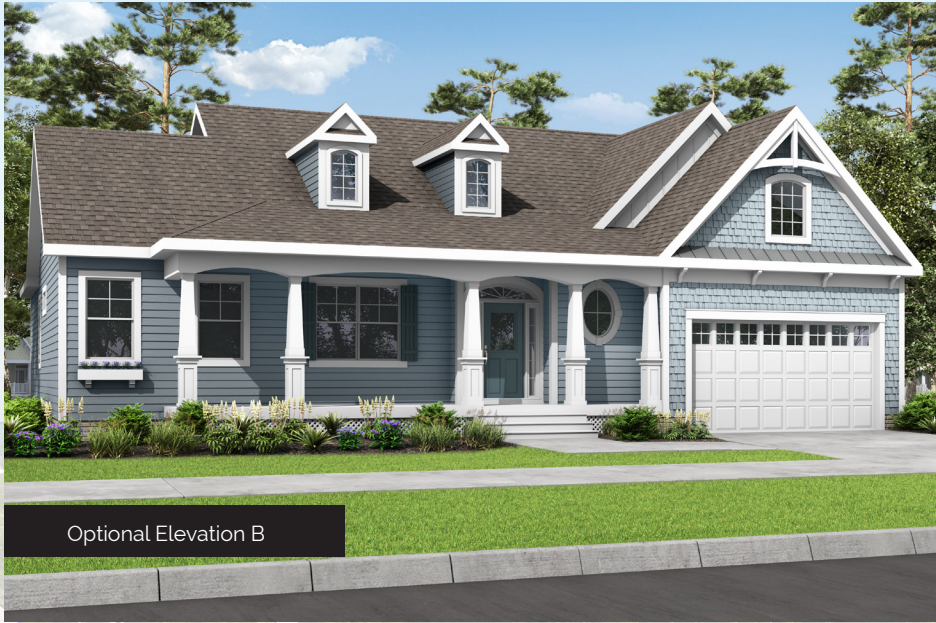
Optional Elevation B