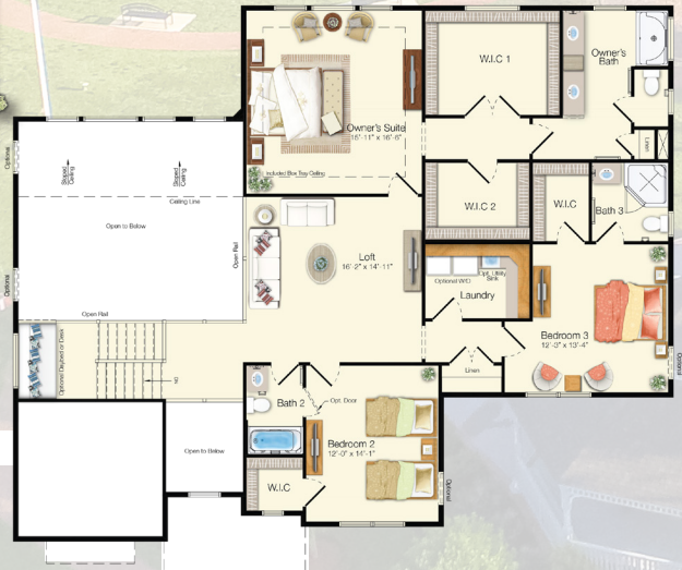
SECOND FLOOR Included Elevation A