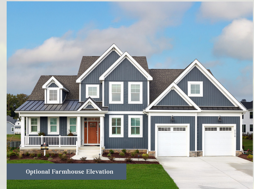
Optional Farmhouse Elevation