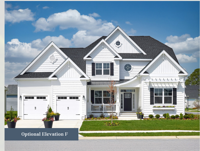
Optional Elevation F