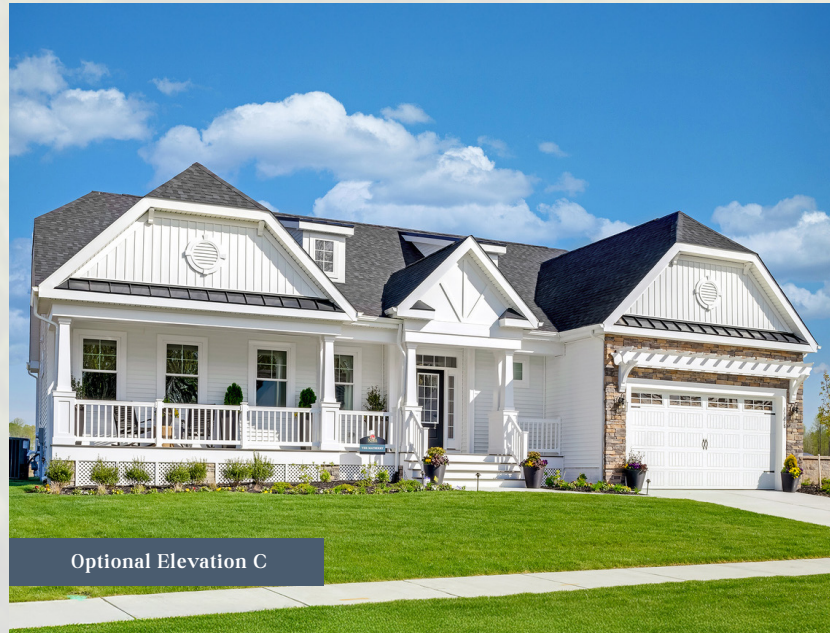
Optional Elevation C