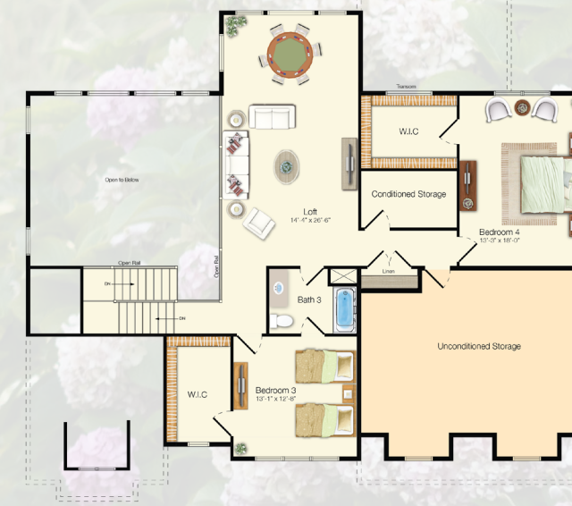
SECOND FLOOR Included Elevation A