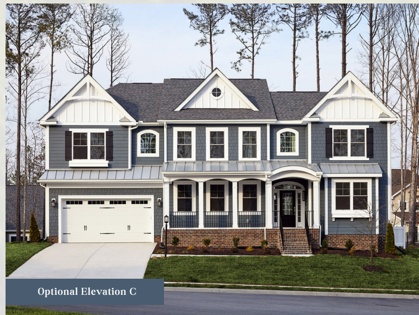
Optional Elevation C