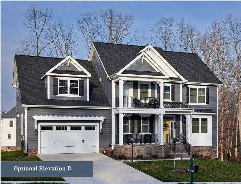
Optional Elevation D