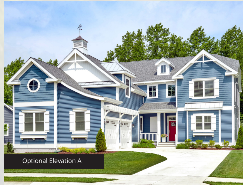
Optional Elevation A