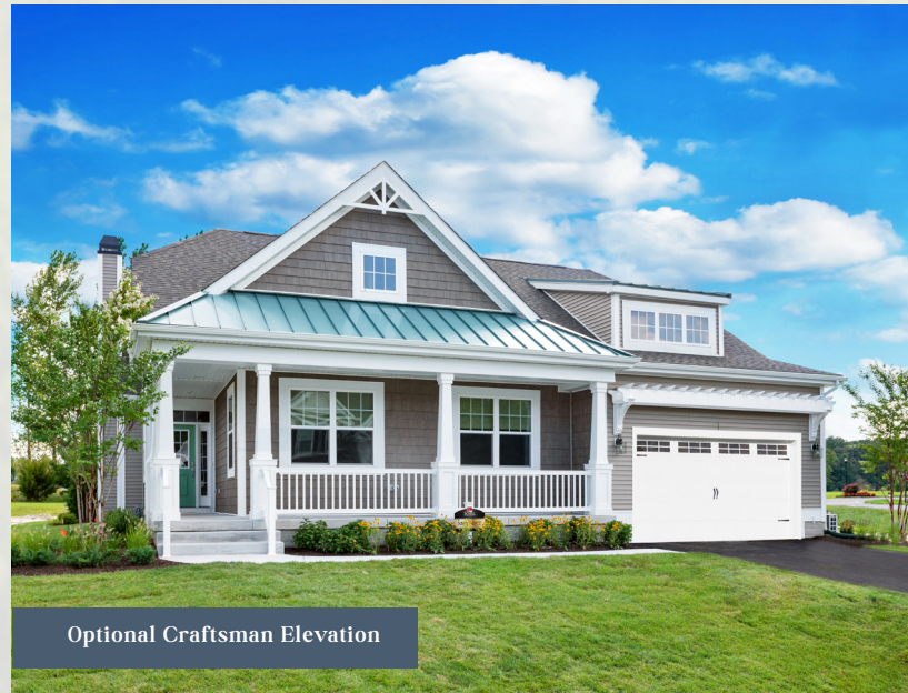
Optional Craftsman Elevation