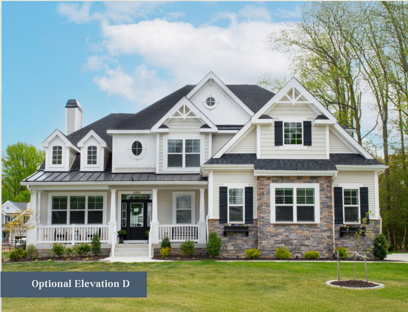
Optional Elevation D