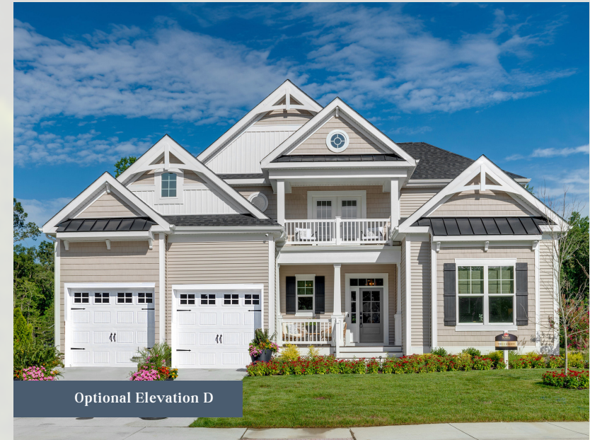
Optional Elevation D