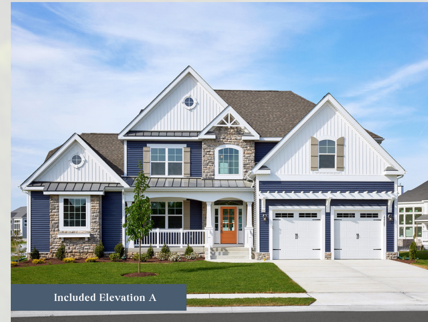
Included Elevation A