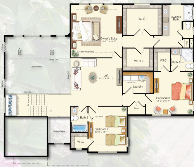
SECOND FLOOR Included Elevation A