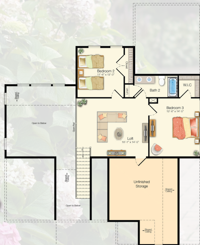
SECOND FLOOR Included Elevation A