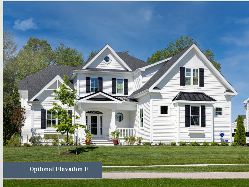
Optional Elevation E