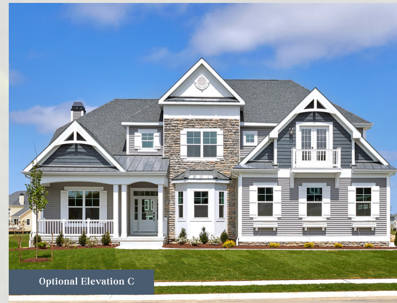
Optional Elevation C