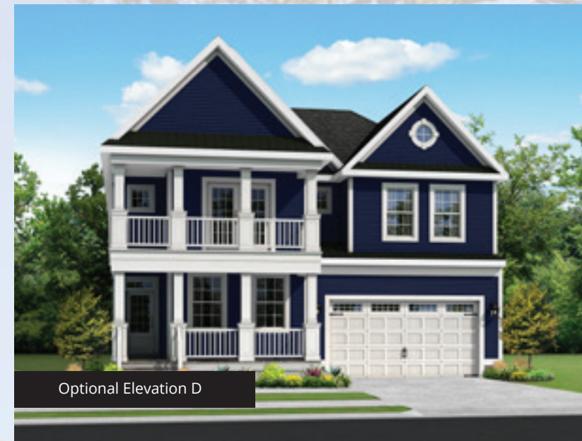
Optional Elevation D