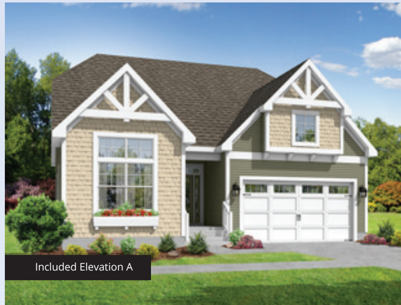
Included Elevation A