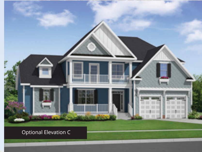
Optional Elevation C