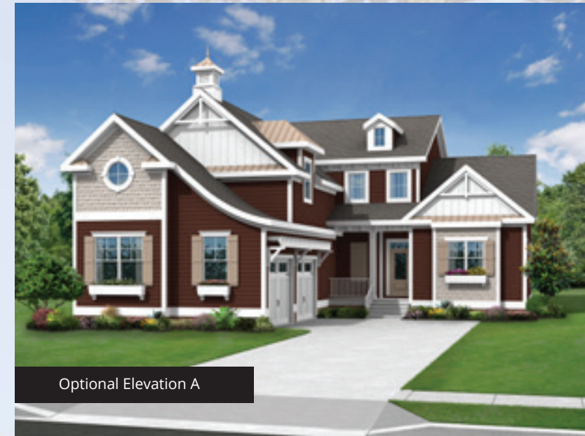
Optional Elevation A