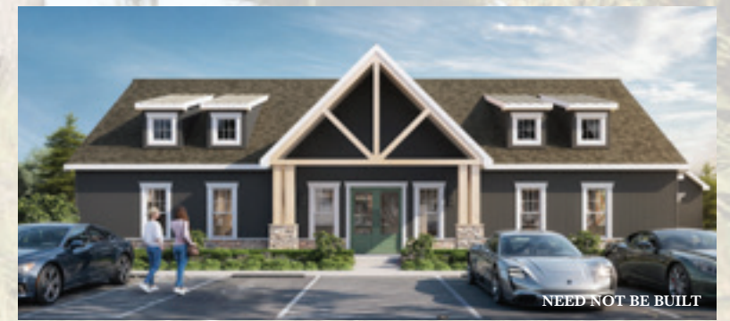
NEED NOT BE BUILT