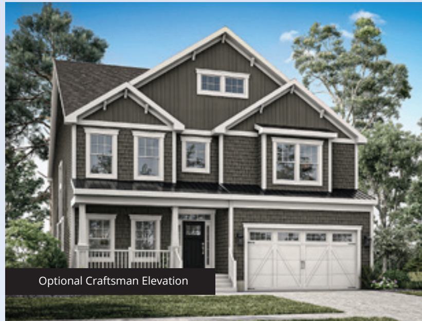
Optional Craftsman Elevation