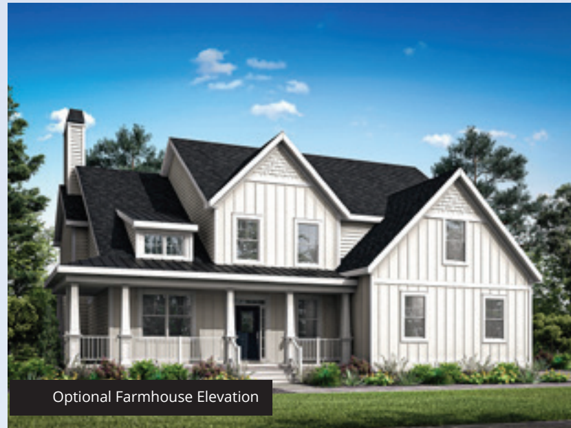
Optional Farmhouse Elevation