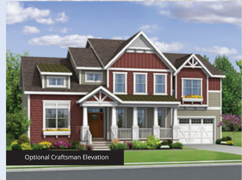
Optional Craftsman Elevation