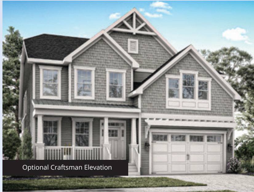
Optional Craftsman Elevation