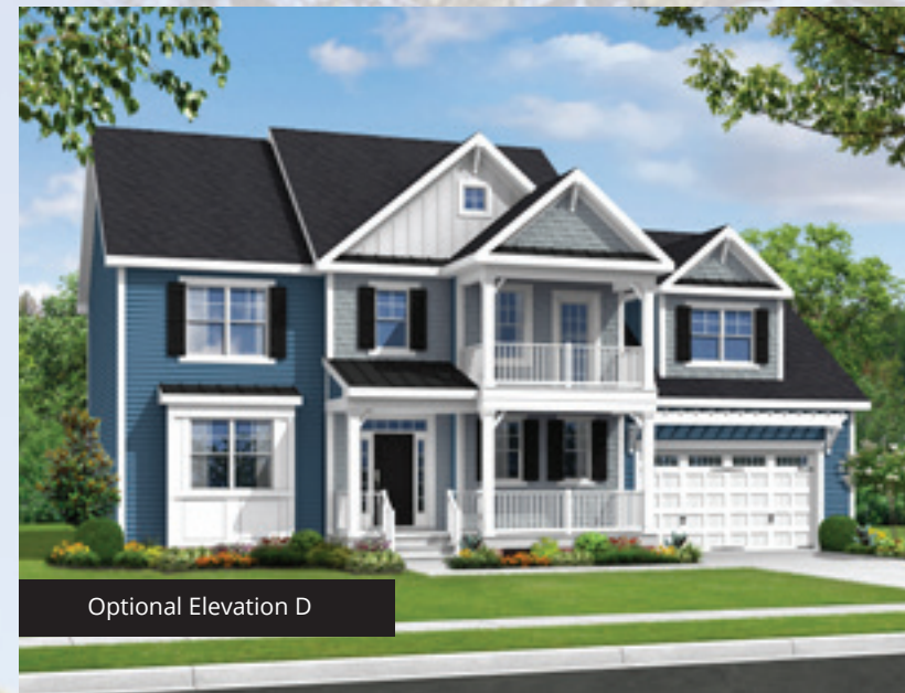
Optional Elevation D