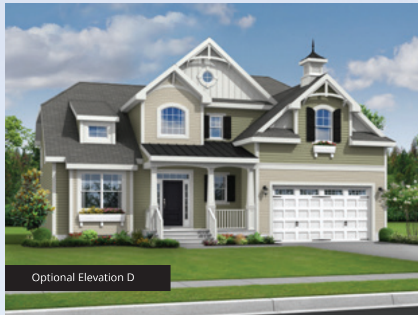
Optional Elevation D