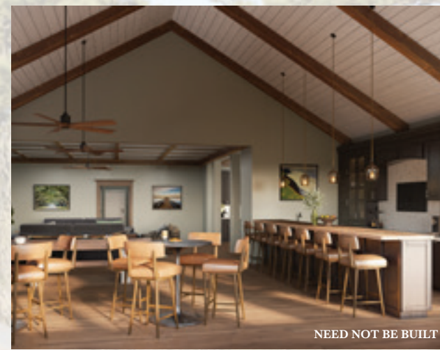
NEED NOT BE BUILT