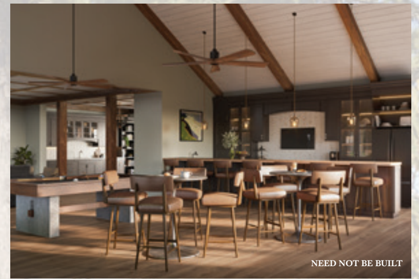
NEED NOT BE BUILT