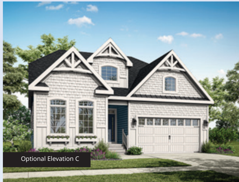
Optional Elevation C