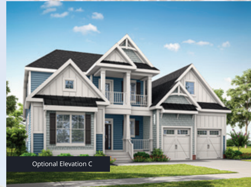
Optional Elevation C