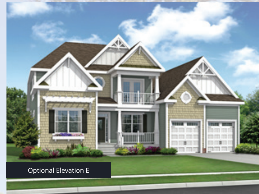
Optional Elevation E