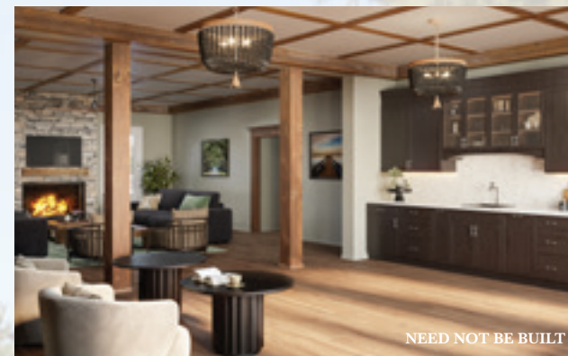
NEED NOT BE BUILT