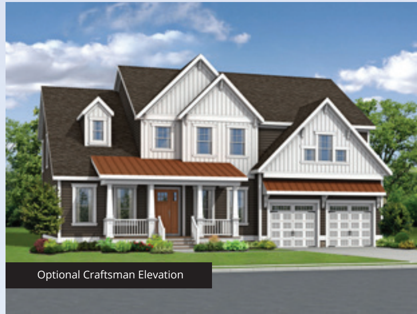
Optional Craftsman Elevation