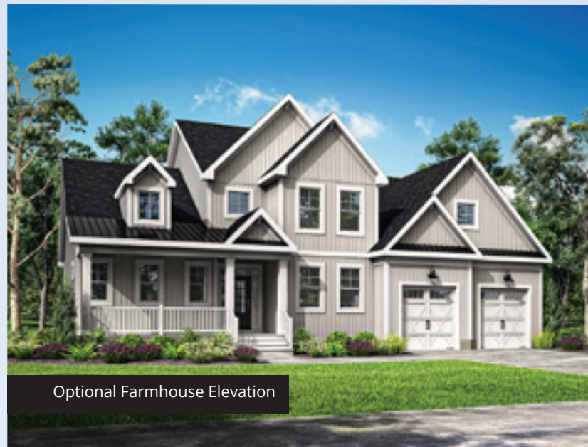
Optional Farmhouse Elevation